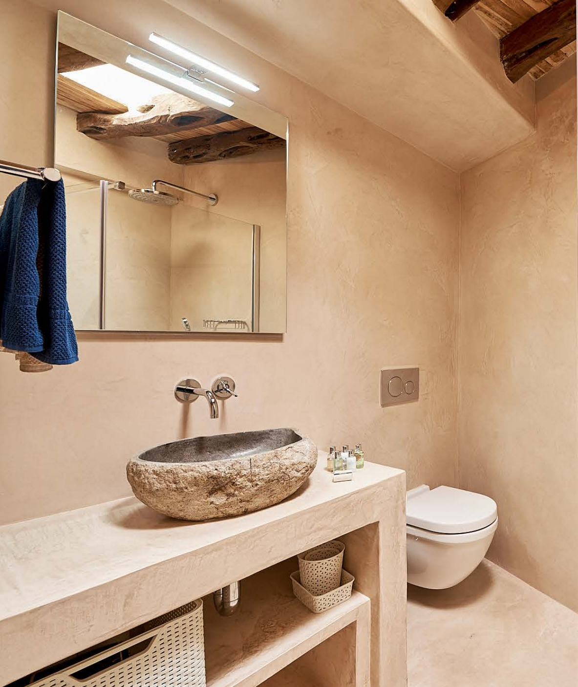
EN SUITE BATHROOM With shower.