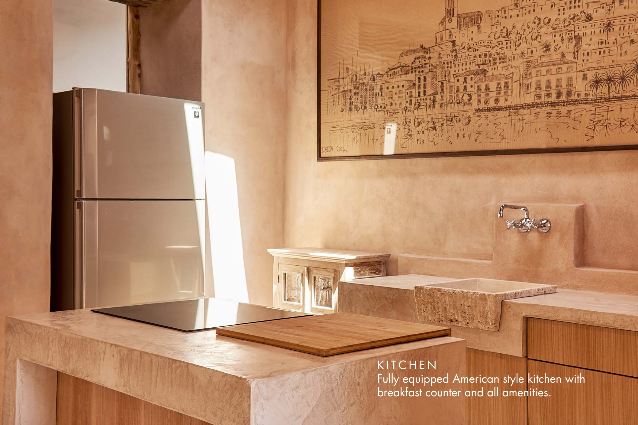
KITCHEN Fully equipped American style kitchen with breakfast counter and all amenities.