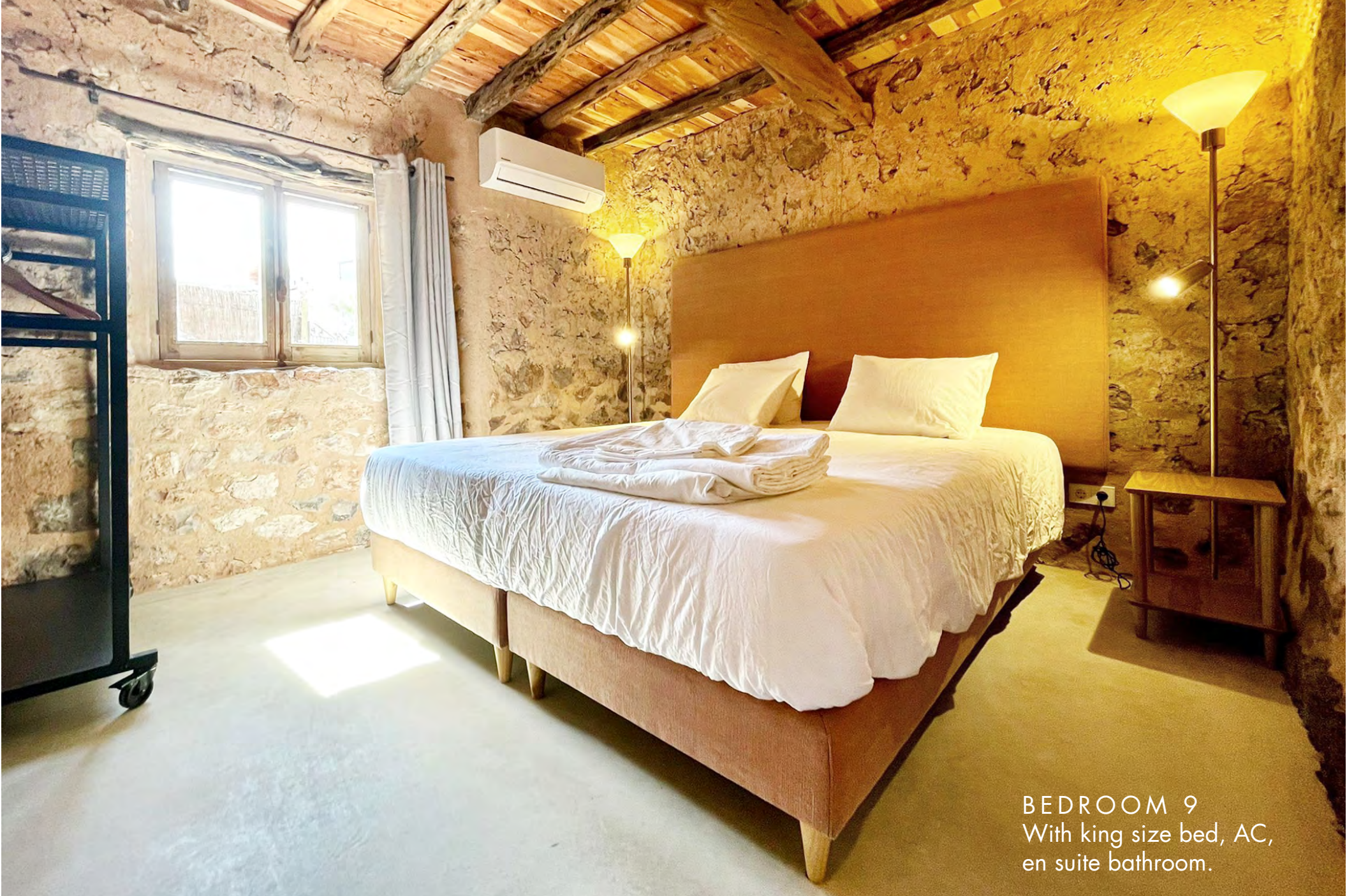
BEDROOM 9 With king size bed, AC, en suite bathroom.