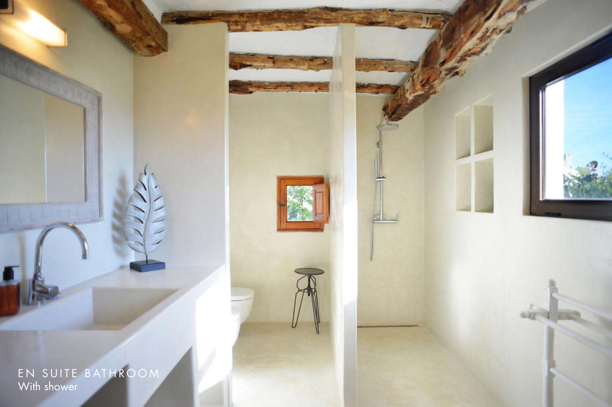
EN SUITE BATHROOM With shower