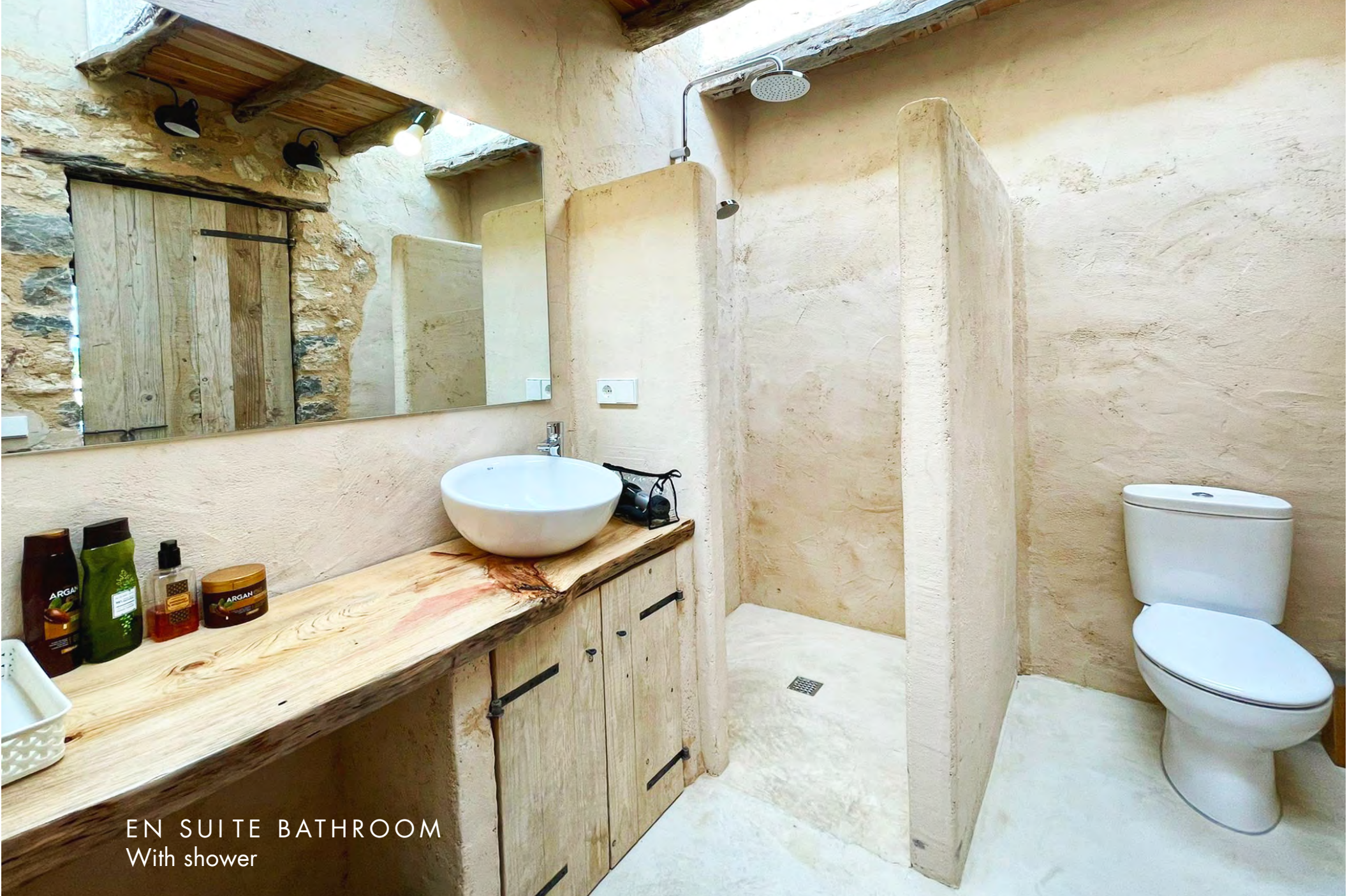
EN SUITE BATHROOM With shower